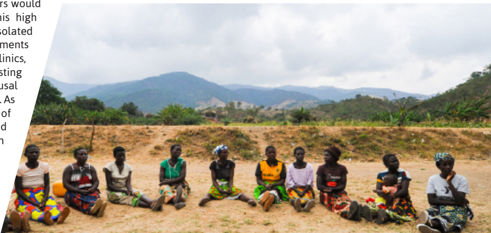
A LICO women ‘study circle’. A support group for pregnant and young women to encourage them to go to ante-natal appointments and get tested for HIV, ensuring their children are born HIV-free.