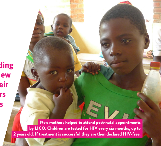
New mothers helped to attend post-natal appointments by LICO. Children are tested for HIV every six months, up to 2 years old. If treatment is successful they are then declared HIV-free.

When Egmont first began supporting partners in six of the most affected countries in sub-Saharan Africa, there were effectively two HIV epidemics in regards to how the disease was being spread. The majority of transmissions were spreading through the adult population, but there was a quickly growing and significant portion that were occurring in children via vertical transmission - from mother-to-child at birth or shortly afterwards. In 2005, the number of infections occurring in children constituted almost a third of all new HIV cases. Life Concern (LICO), an Egmont partner based in Rumphu, Malawi, has been a part of the effort to reduce this transmission rate.